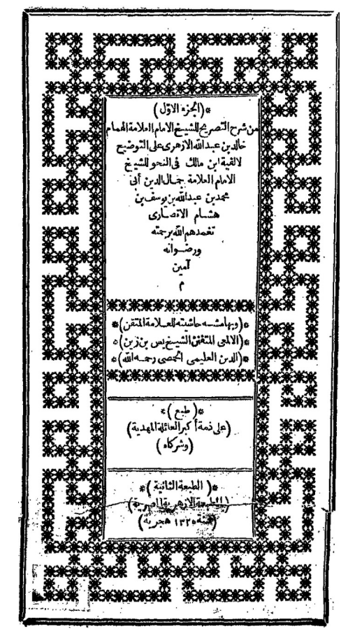
A commentary on a 13th century text on grammar, published in Cairo, 1907

Furthermore, in addition to transforming the content of the literary corpus, the movement of editing also revolutionised its form. The first works of Islamic scholarship to be printed were mostly drawn from the postclassical texts that dominated the literature in the nineteenth century. These were typically embedded in and printed with layers of commentary, the text followed the underlying manuscript closely (even reproducing errors), and no editor was mentioned. But as the scholarly publishing field began to gather steam, the output of postclassical prints was quickly dwarfed by a flood of published classical works, and these now carried the names of their editors prominently on their covers. Another innovation was the inclusion of critical apparatus, making evident the editor's role as a critical and expert »co-producer« of the final, published work.