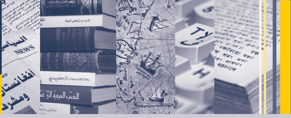
History, Society and Culture in Asia, the Middle East and Africa

»Evaluation«– this term prompts very different expectations and reactions. Generally speaking, academic evaluations aim at generating knowledge about the quality of research and results. If performed at an institutional, rather than at an individual level, they are meant also to assess the conditions under which work is completed. The main aim is – ostensibly – the constant improvement of the conditions under which academics work, and hence improved results. On a secondary level, such evaluations are used as a policy instru-