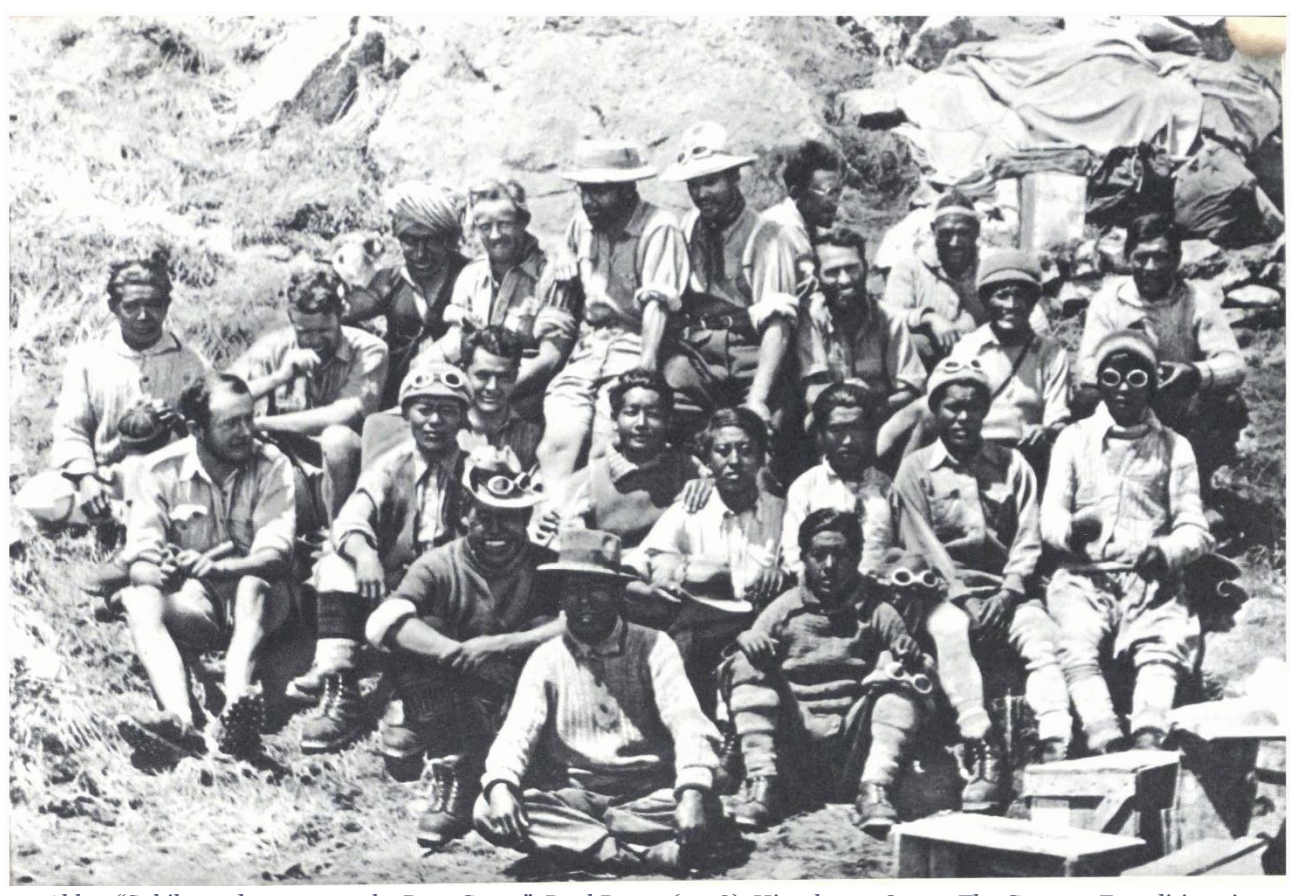
Abb. 1 "Sahibs and porters at the Base Camp". Paul Bauer (1938). Himalayan Quest: The German Expeditions in Siniolchum and Nanga Parbat. Plate 74.

(Höbusch 2003: 32). Fritz Bechtold's Deutsche am Nanga Parbat (1935 – Germans on Nanga Parbat), the most famous work of German alpine literature in the first half of the twentieth century, went through twelve editions until 1944 (Holt 2008: 275). Bechtold's narrative of the 1934 expedition constructed the expedition in line with the fascist ideology of sport. The key components of his book stressed the marshalling of chaos into order, adhered to the Führer principle, depicted "only German" members and used military rhetoric to praise the sacrifice of the individual in serving the nation and disciplining the body (Höbusch 2002). The documentary Nanga Parbat: Ein Kampfbericht der deutschen Himalaja-Expedition 1934 (Nanga Parbat: A Frontline Report on the German Himalaya Expedition of 1934, 1935) was used as propaganda in the Third Reich for over two years and was also shown at the end of the Winter Olympics of 1936 (Holt 2008: 275). There was another expedition in 1938 led by Paul Bauer by another route with the base camp at either Mansehra or Abbotabad.<sup>3</sup> This attempt failed, and so did the subsequent expedition in 1939 led by Peter Aufschnaiter, which was cut short due to the declaration of war between Germany and England.