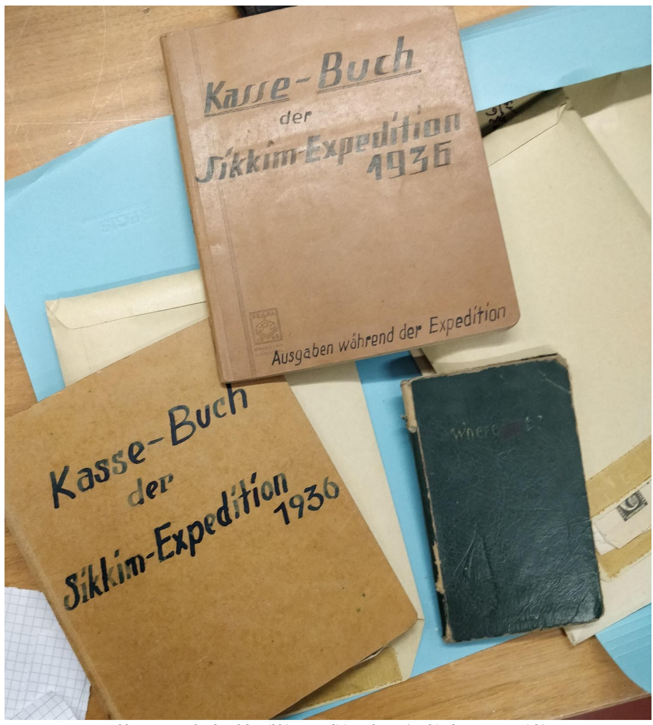
Abb. 2 Account books of the Sikkim Expedition of 1936

The most revealing of all these are documents on expedition finances. Such material ranges from broad statements on income and expenditure to the daily bookkeeping of the expedition. This material contains the fingerprints of the porter, both figuratively and literally. A file titled Brochüre contains details of the porters recruited in Darjeeling with their personal information, such as their addresses, next of kin and fingerprints, the details of their payment depending on which camp the particular porter went up to and at the end a remark by the European climber, his sahib, commenting on his performance on the mountain, which would determine his employment on future expeditions.<sup>5</sup> The pages of this register account for only a handful of the porters, including the cook and the sirdar